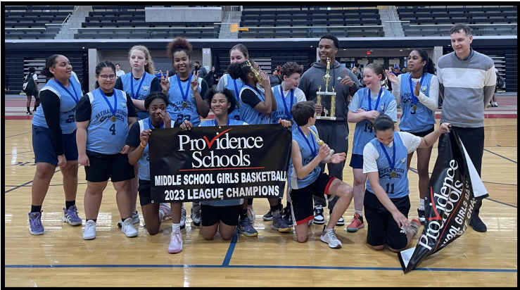
Above: The Bishop Girls Basketball team celebrate their victory over Nathanael Greene Middle School

The Lady Cougars were impressive in track and field with the girls winning each event, coming in first place. The boys came in second. All in all, our Cougars were very successful this year in track and field. The 2022-2023 year brought a lot of success in sports to Nathan Bishop. In fact, the girls won every single championship this year and in total our school won 5 of the 8 finals. Congratulations to everyone who participated in sports this year. We 8th graders pass the torch to upcoming grades and wish you all the best in coming sports seasons!