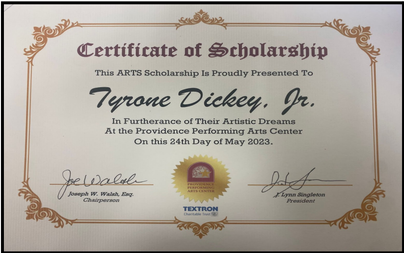
Above: An ARTS Scholarship Certificate for a Nathan Bishop Winner