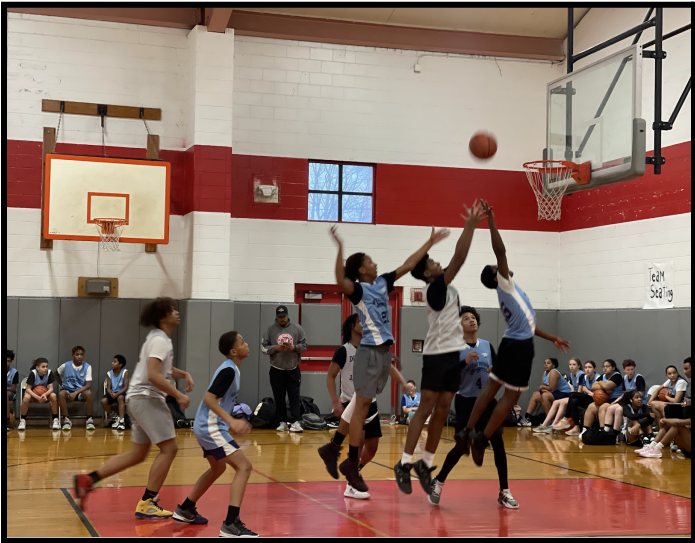
Above: The Nathan Bishop Boys Basketball Team competes in a game during the Winter.

The 2022-2023 school year was a year to remember for our athletes and sports teams here at Nathan Bishop. We began with soccer and cross country and wrapped up with track and field. Soccer and cross country started in the fall and was just as successful as they were last year. In similar fashion to the 2021-2022 season, the girls soccer team won the city championship going undefeated. Unfortunately, the boys soccer team was not able to repeat as city champions, losing in the semifinals to Del Sesto 2-1. Fall sports soon transitioned to the start of basketball season. From the beginning, our Lady Cougars absolutely dominated the competition. Led by the 8th grade girls, the Cougars were able to complete a perfect season, capping it off with a city championship trophy. Unfortunately, the boys were not as successful. Although they pushed hard to make the finals, our Boy Cougars fell short on their goal, failing to qualify for the playoffs.