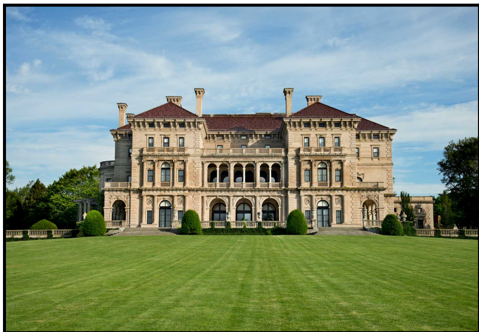
Above: The Breakers Mansion in Newport.

The 7th grade was able to learn about Naval history with a trip to Battleship Cove. Battleship Cove is a maritime museum located in Fall River, Massachusetts. The 7th graders saw the largest collection of preserved Naval vessels in the world, including the USS Massachusetts Battleship.